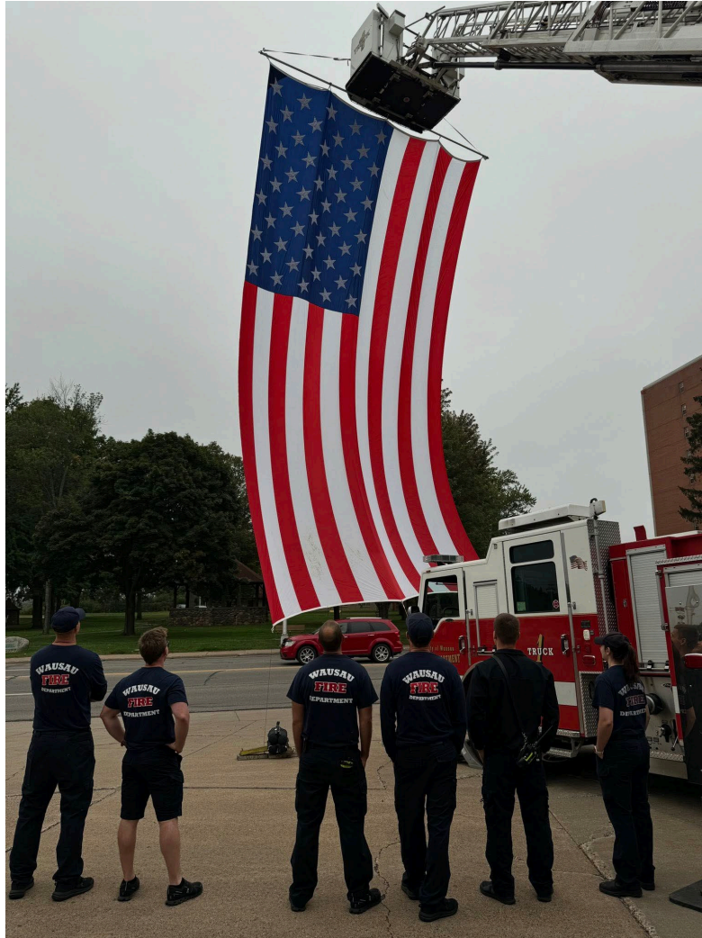
(WFD personnel set up flag for 9/11 on Grand Avenue)